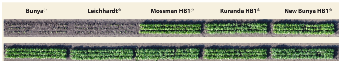
Image 2 – Drone imagery of trial plots taken 10 days after the treatments were applied, showing the effect of Halosulfuron applied at first fully expanded trifoliolate leaf stage (top), compared to the nil herbicide treatment (lower). Mossman HB1 Ⓛ , New Bunya HB1 Ⓛ and Kuranda HB1 Ⓛ have 1-gene tolerance to Halosulfuron-methyl herbicides while Bunya Ⓛ and Leichhardt Ⓛ have no tolerance of these herbicides.