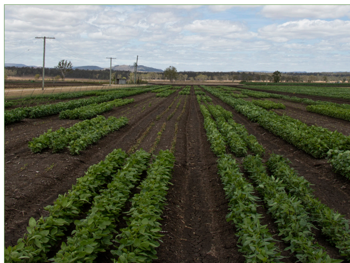
Using Sempra® to control nutgrass in tolerant soybean varieties