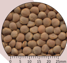
PBA Herald XT ®

PBA Herald XT ® is a small-sized lens-shaped red lentil with a grey seed coat. Seed size, as measured by 100 seed weight, is similar to Nipper ® but flatter and slightly larger in diameter.