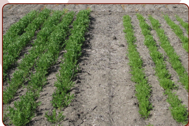
PBA Herald XT ® (left) compared to Nipper ® (right)